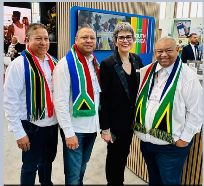
The Cape Winelands invited the world to our neck of the woods by showing off what we have to offer at the ITB Berlin 2024 held from 5 to 7 March. The Cape Winelands District Municipality (CWDM), together with the local tourism association, Visit Stellenbosch proudly represented at the South Africa stand.