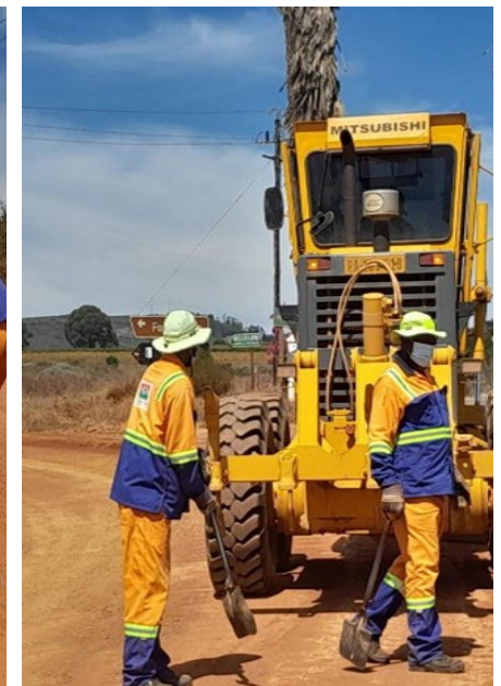
Roads teams-full PPE while working on gravel roads, exposed to dust