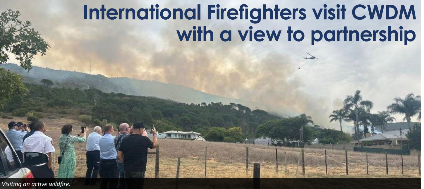
Visiting an active wildfire.

“Firefighting is the same all over the world, but the systems are a little different,” stated Chief Fire Officer Kai-Uwe Lohse of Saxon-Anhalt, Germany during a recent visit. “It has been very interesting to visit with our Cape Winelands firefighting brothers. In Germany, we are also experiencing the effects of climate change. We have seen a marked increase in forest fires due to the high fuel load caused by the hotter, drier summers we have been experiencing. We are looking forward to a long and fruitful relationship.”