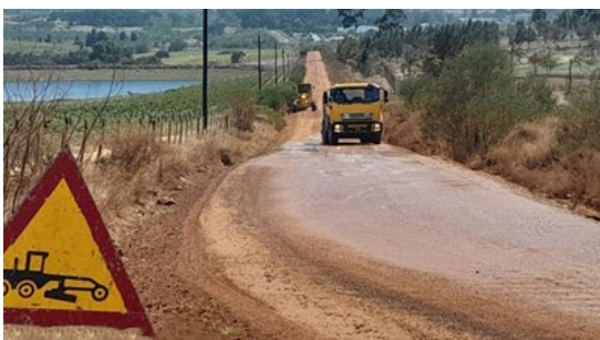
Roads teams- Water truck to control dust