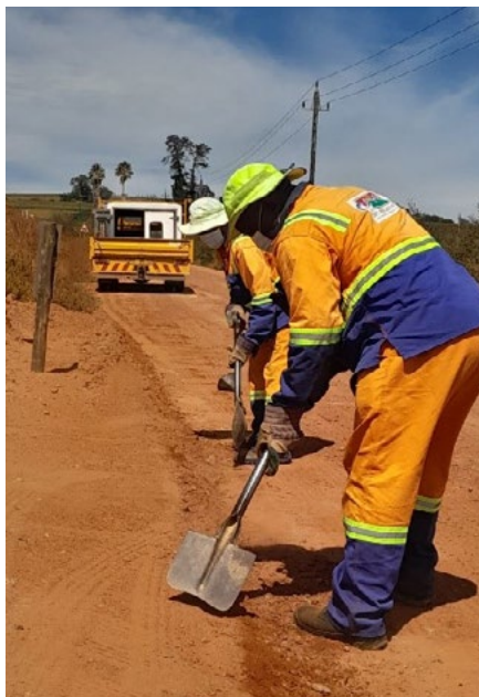
Roads teams-full PPE while working on gravel roads, exposed to dust