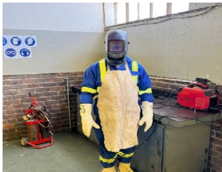
Appropriate PPE (personal protective equipment) for welding worn. Welding Screens being used to prevent workers operating in close vicinity of the welding area are not exposed to harmful UV light or the risk of flash burns.