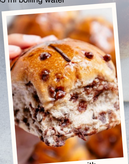
Hot cross buns with chocolate chips